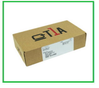
1. You will receive sealed box for your phone. Open the box by cutting the shipping label.