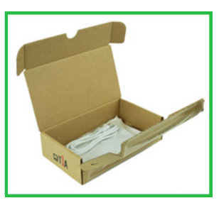
3. The clamshell is attached to the box. Open it, and place your phone cable inside.