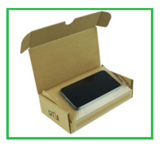
5. Close the clamshell with the phone by folding it on the top of the cable.