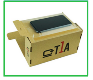
4. Then, place the phone in the clamshell and secure it by folding it.