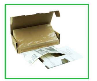
2. In the box you will find the label with the return shipping address and the packing instructions.