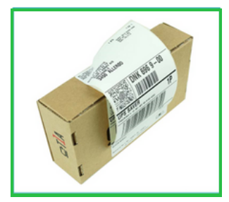
6. Close the box, and secure it with the return shipping label. Stick the label on the top of the other one. The return address is: Solvang 6, 3450 Allerød, Denmark.