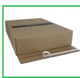
8. Seal the box. Check if it is well closed.