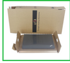
3. Place the laptop in the clampshell and fold it.