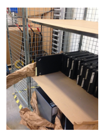
Laptops and desktops <u>must</u> be packed as shown.

<u>NOTE:</u> Make sure the heaviest equipment is packed at the bottom. All printers and desktops should be placed on the bottom shelf.