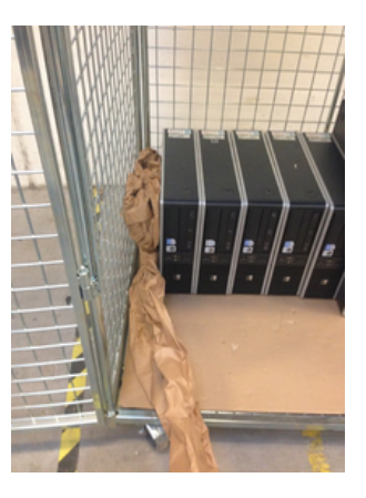
The recycled paper should be placed in the peripheral areas in order to protect the devices during transportation.

<u>NOTE:</u> Make sure the heaviest equipment is packed at the bottom. All printers and desktops should be placed on the bottom shelf.